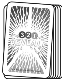
Players Ready to play deck

For more rules go to www.keycreations.co.uk