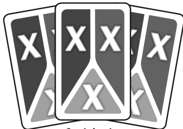
Cards in play