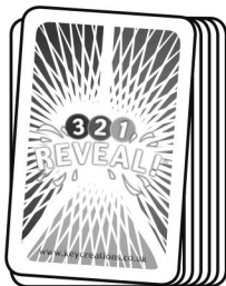
Centre cards pack